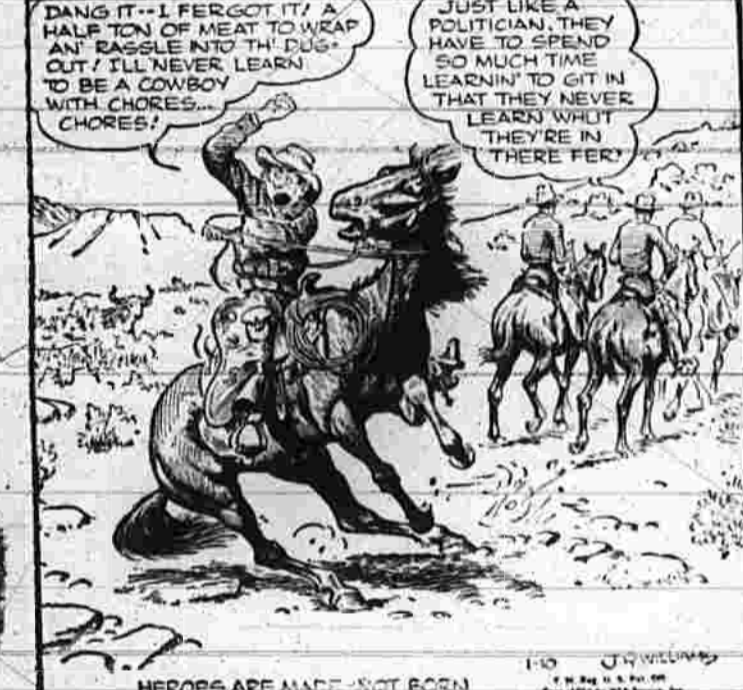
OUR BOARDING HOUSE