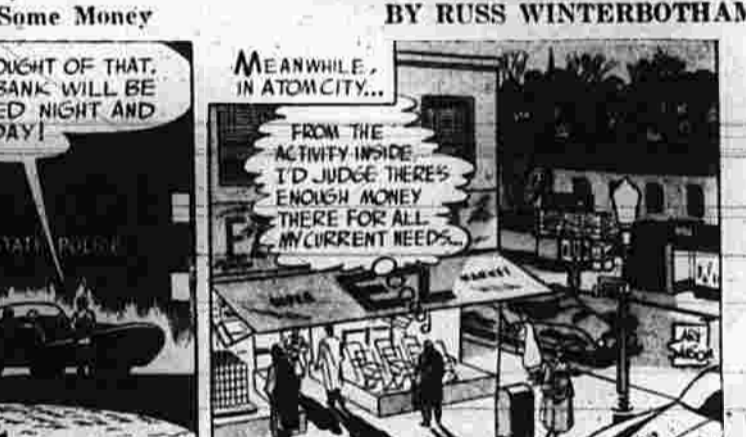
NOW THAT WE KNOW