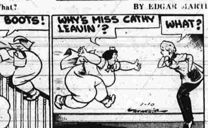
NOW THAT WE KNOW