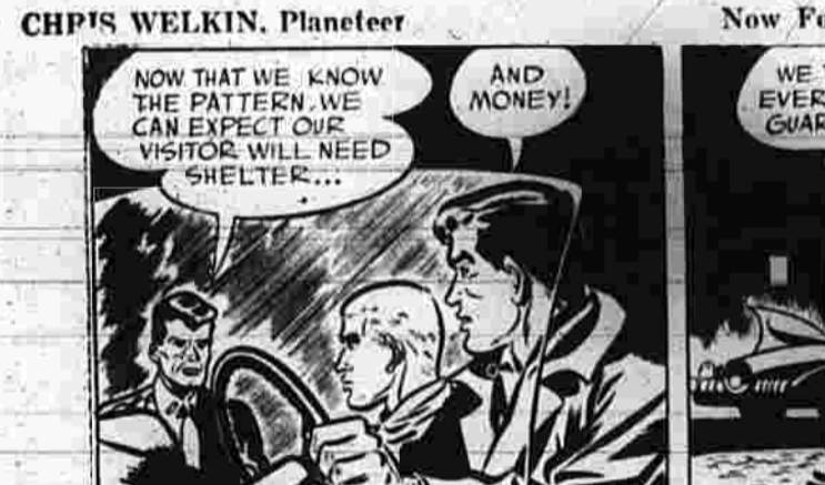
NOW THAT WE KNOW