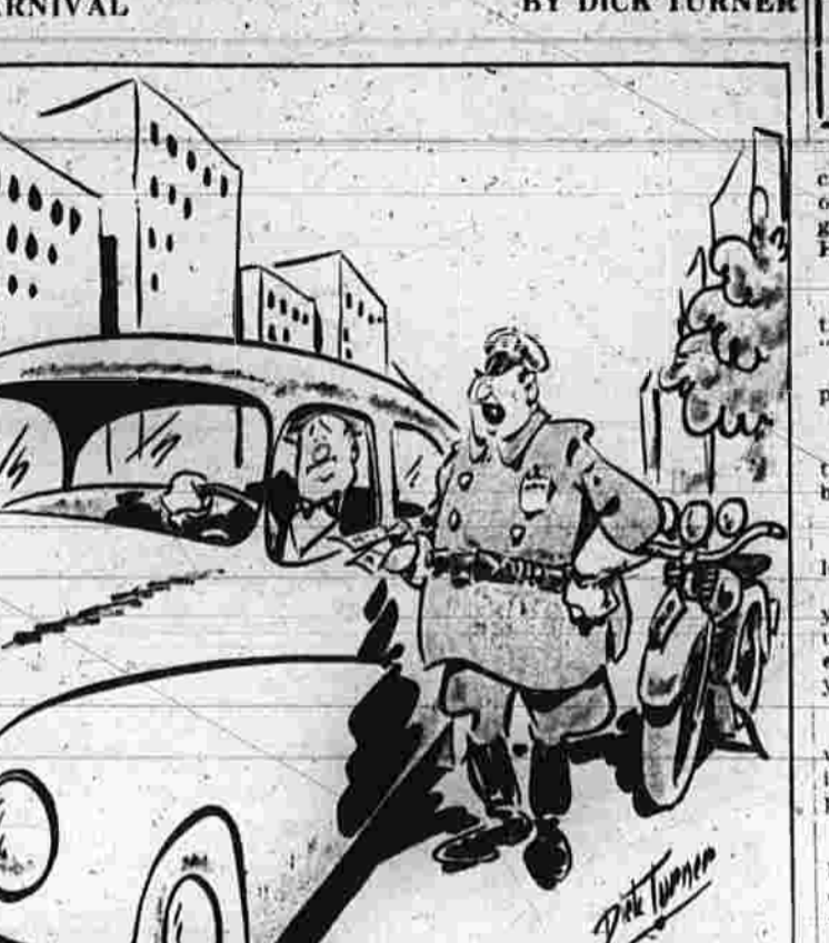
OUR BOARDING HOUSE