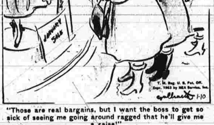
There's Your Man