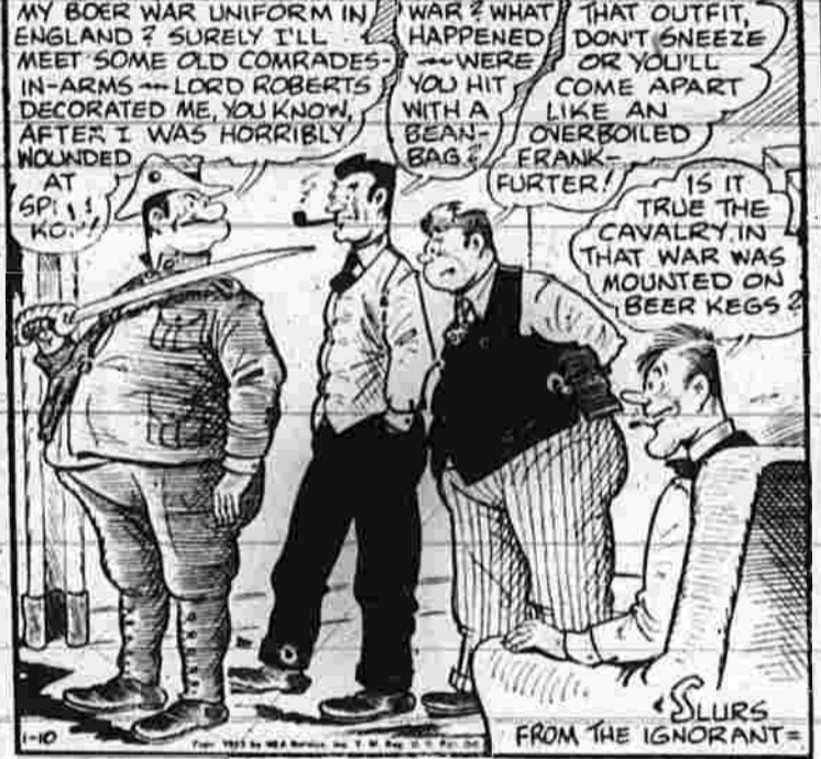
OUR BOARDING HOUSE