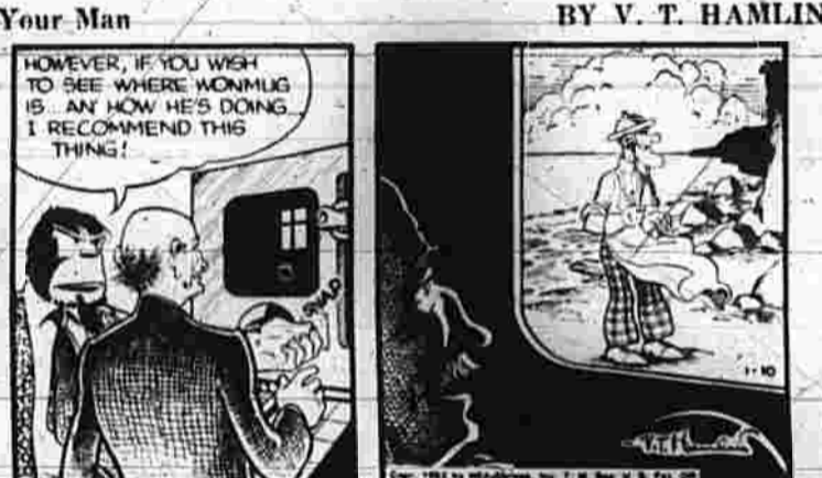
There's Your Man